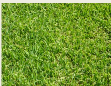
Soft Leaf Buffalo

There are many types of species available in Queensland with many cultivars having subtle differences within those species. There are numerous well adapted grasses to choose from. Turf Queensland members can advise you on the appropriate grasses, or you can contact Turf Queensland Inc directly on info@qtpa.com.au